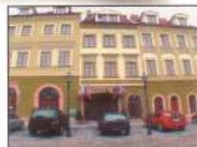
Hotel U Královny Elišky